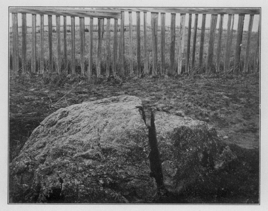
Fig. 2 SCENES OF CHILULA MYTHOLOGY