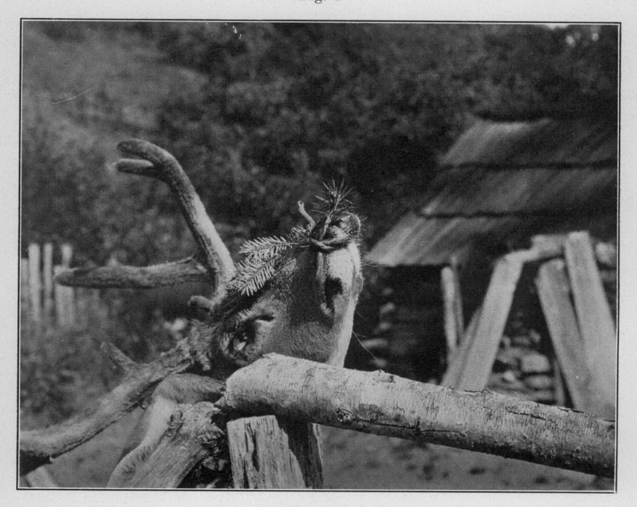
Fig. 2 CHILULA LIFE