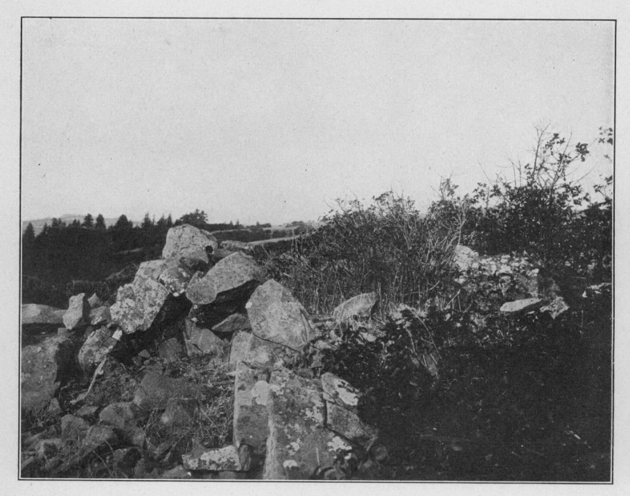
Fig. 2 IN THE LAND OF THE CHILULA